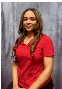
#7: Jamie Stovall Mills Nursing and Rehabilitation Center