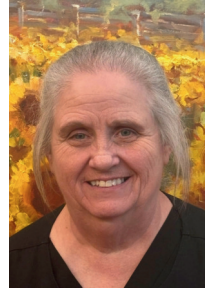
#2: Glenna Wagers Hazard Health and Rehabilitation Center