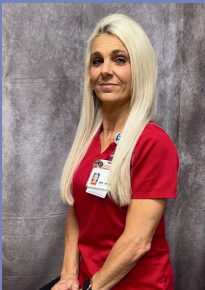
#5: Amy Ashby Mills Nursing and Rehabilitation Center